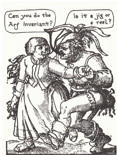
Drawing by Carolyn Snaith 1981 London, Ontario